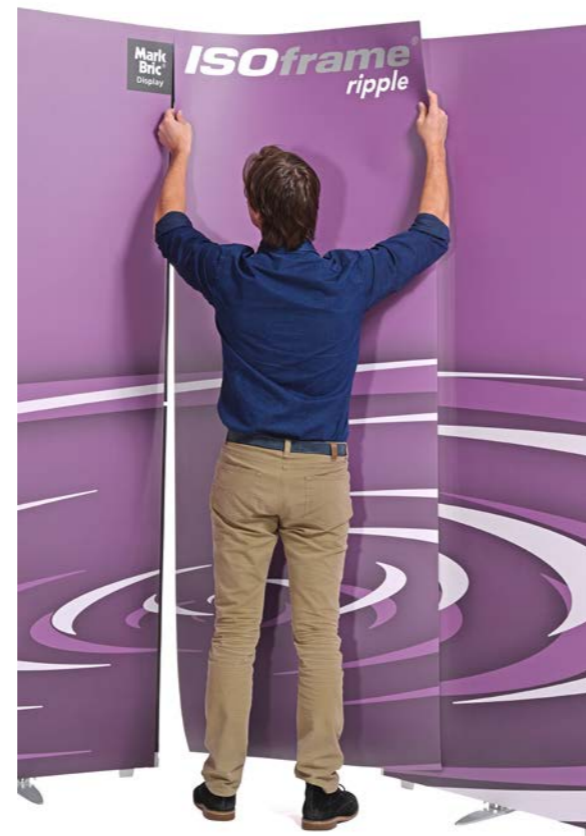
Add a flexible link panel