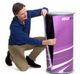
Wrap around the graphic