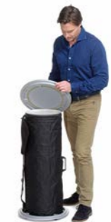
Apply the counter top