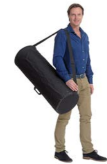
Shock-proof carry bag with cardboard inner tubing