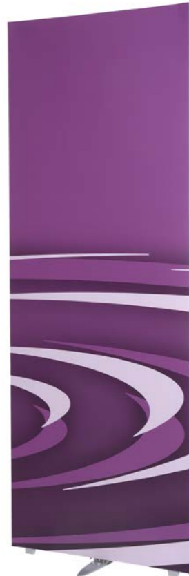
Two Ripple banner stands