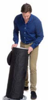
Insert case into wooden base