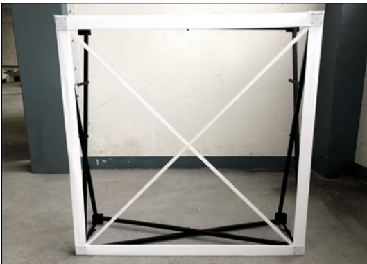
3. Check if everything is taut