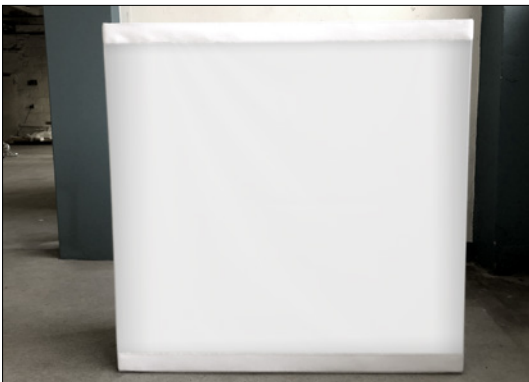
5. Make sure the fabric is wrinkle-free