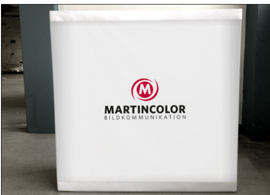
7. Look again if the fabric is wrinkle-free