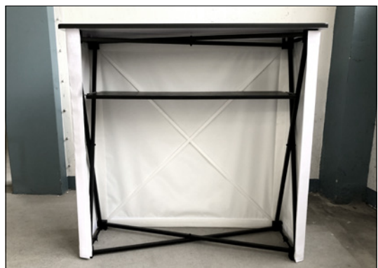
8. Apply the boards