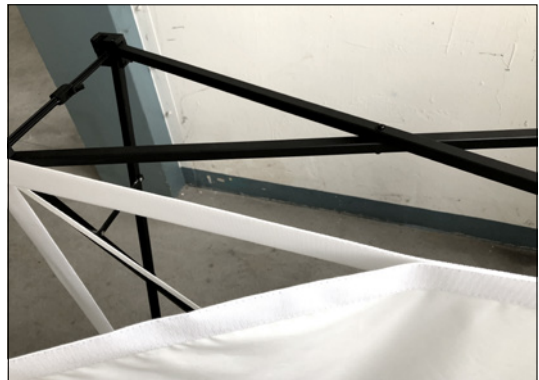
4. Put the opaque fabric on the velcro frame