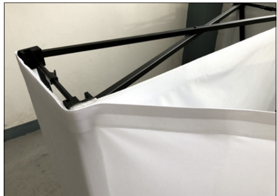
6. Put the printed fabric on the opaque fabric